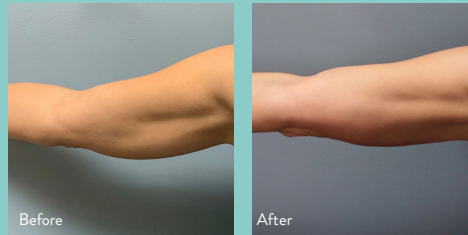
Dr. D. Kiba

For patients wanting to turn back the hands of time without any further disruptions to their daily activities, EvolveX treatments are ideal - there is no surgery, no anesthesia, no scars, and no downtime. You can return to your regular routine immediately after these total body procedures.